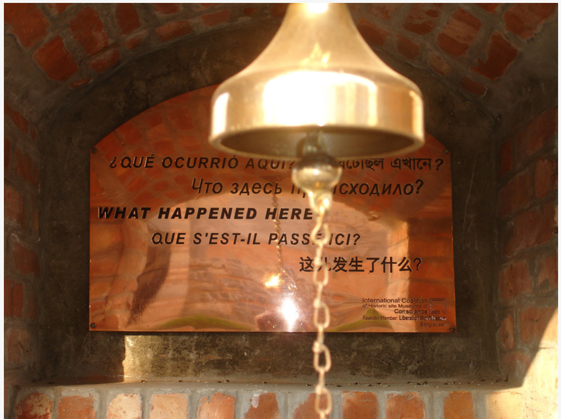
A plaque at a killing site in Bangladesh sponsored by the Liberation War Museum.