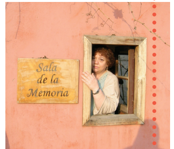
Villa Grimaldi Peace Park, Chile