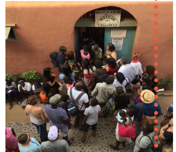
Maison des Esclaves, Senegal