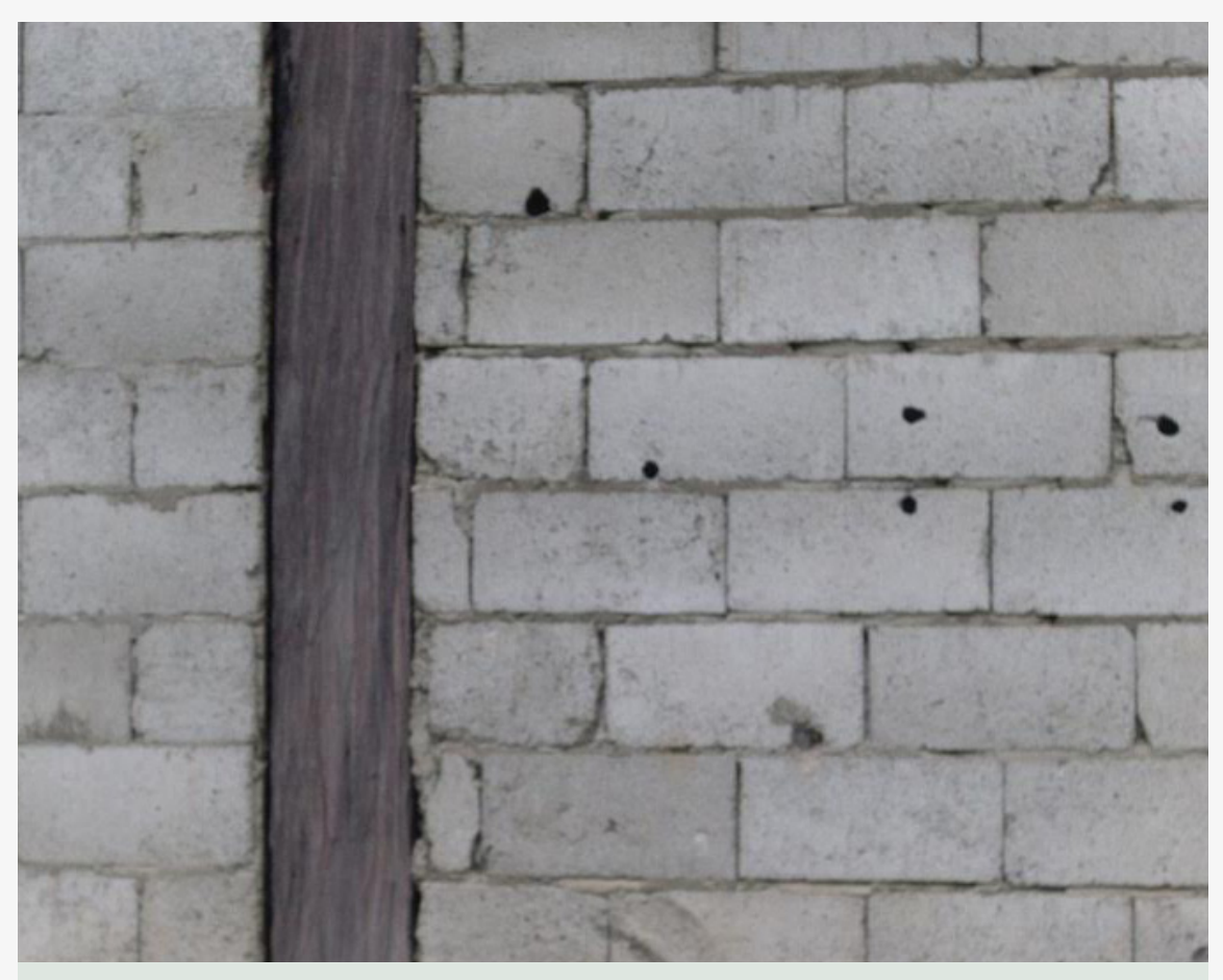
This forms part of the wall of the Tacbil Mosque. According to local residents, when they attempted to clean all the blood from the walls of the mosque, the blood came back the next day and they have left it untouched since. The mosque is still used by the community to this day.