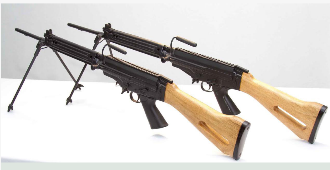
These guns were donated to the Moro Islamic Liberation Front in the 70s and were used during the war.