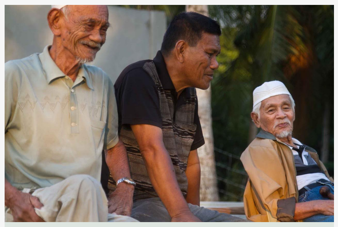
The picture shows three generations of the Moro Islamic Liberation Front. One of the founders, Grand Mufti Sheik Omar Pasigan with Haji Usman and a much younger battalion commander of the Bangsamoro Islamic Armed Forces, who all have seen both the war and peace process.