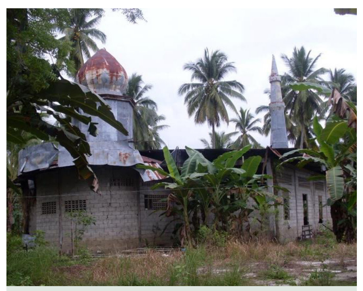
Tacbil Mosque – The site of the tragic Malisbong or Tacbil Mosque massacre, which happened on September 24, 1974. Two years after the martial law was declared, 1500 muslim men, women and children were killed by the Philippine military in this town.

The struggle of the Bangsamoro is rooted in the historical injustices done to their identity and their people. Bangsamoro was not a part of the Spanish-colonized Philippines and was only annexed after the United States took power. Philippine history does not typically recognize this original independence and makes no reference to this recent annexation in the official history taught in schools. The Bangsamoro's Muslim identity is also ignored in favor of promoting a dominant narrative of the Philippines as the only Catholic nation in Asia.