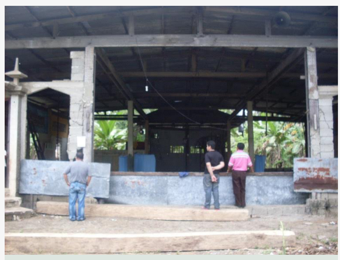
Community members retell the violent fate the people surrounding the Tacbil Mosque.