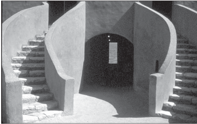
The double staircase at the Slave House in Senegal

opment Corporation, the entity responsible for developing the site; Daniel Libeskind, the master planner; and the Freedom Center, a team developing a museum at the site. We discussed issues such as making memorializing a democratic process, using historic fab-