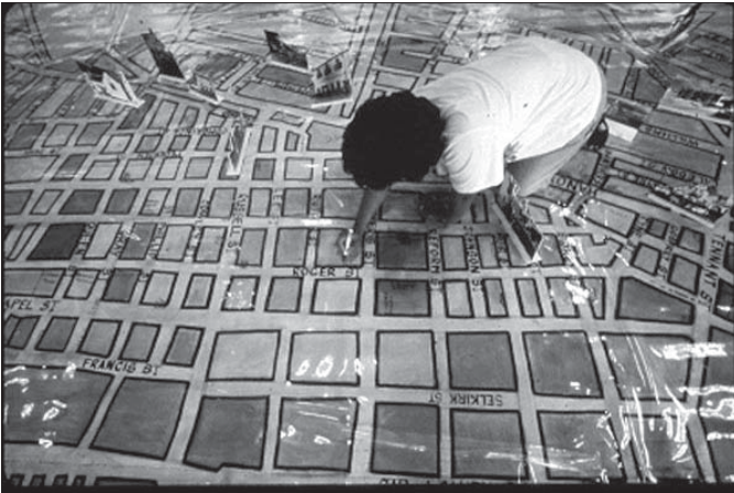
Former residents mark their homes on a map at the District Six Museum

and interrogation rooms of the camp, a facilitator leads visitors in a discussion about the future of democracy in Russia and what each one of them can do to guarantee it. The Museum does special outreach to school children, integrating the experience into local curricula.