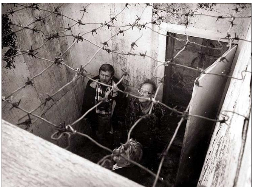
The Gulag Museum at Perm-36

Perhaps no memorial project is more contested or has more international interest than the development of the World Trade Center site in New York City. Recognizing the Coalition’s rich experience with memorializing tragedy and interpreting difficult issues, its experience creating effective and forward-thinking civic spaces at sites of destruction, several developers of the site came to speak with the Coalition about the challenges they faced. The Coalition engaged in important exchanges with the Lower Manhattan Devel-