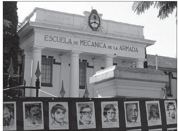
Former Navy School and torture center that will become the new Museum of Memory in Buenos Aires

This statement established a new role for historic sites in the world, partnering us with the international